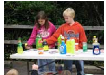
4th graders match harmless products with hazardous chemical look-alikes.