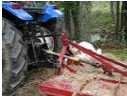
PTO entanglement is easier to understand when you see what happens to the straw dummy.