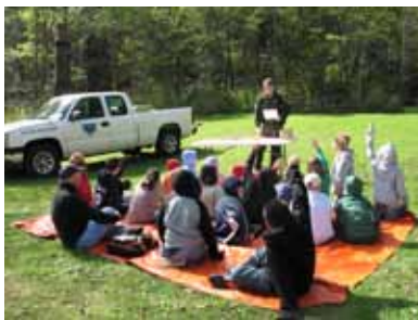
New River State Park rangers teach outdoor safety to 4th graders.