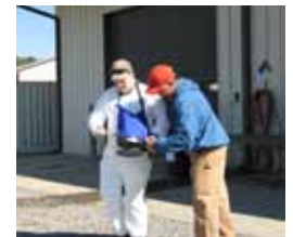
Chemical safety comes alive with hands-on activities.