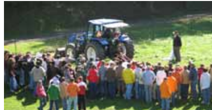
High school students view the PTO entanglement demonstration.