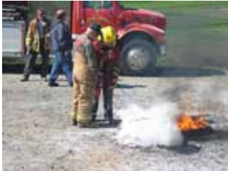
High school students practice using a fire extinguisher.

The students had an active day, lying low while they crawled out of a fire house and climbed down an escape ladder, simulating a safe exit from a burning building. They also discovered how hazardous household chemicals look a whole lot like sports drinks and other food items. The icing on the cake was being able to move from station to station through the beautiful surroundings of their outdoor classroom.